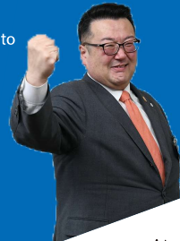
The Mayor of Semboku City Taguchi Tomoaki

We hope that you refer to this leaflet and plan to start your career in our city. Please come visit Semboku City and experience its possibilities. Semboku City is looking forward to your visit!