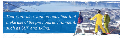
There are also various activities that make use of the previous environment, such as SUP and skiing.

Semboku city has an excellent natural environment, including Lake Tazawa, hot springs and ski resorts.